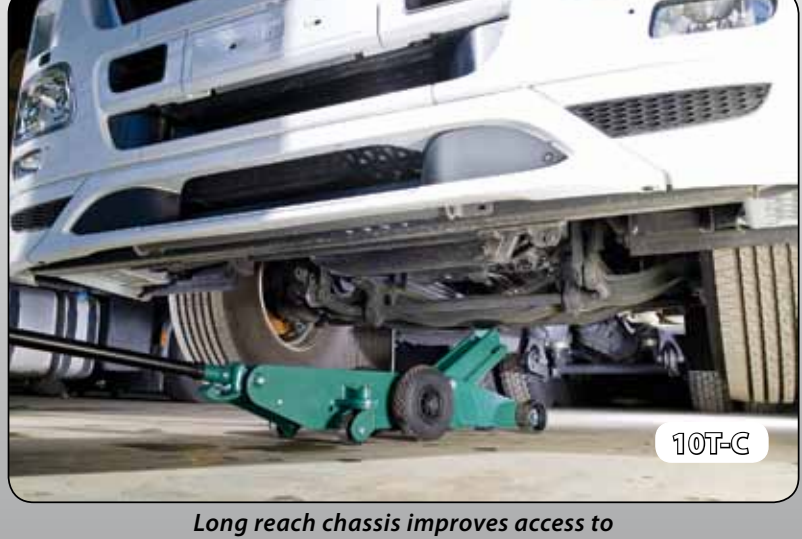
lifting points deep under trucks.